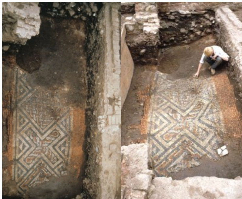
1 Exeter mosaic excavation in Catherine Street

The Romans built mosaics for the floors, walls and ceilings in their houses. They would have been very expensive, so not everyone would have had them. They were made by experienced craftspeople.