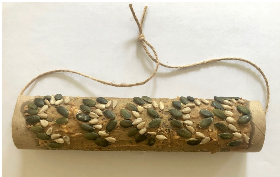
4 Example cardboard roll birdfeeder, by S Creek