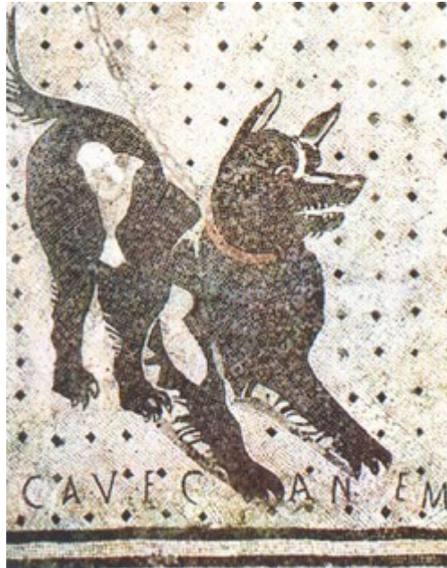
5 Beware of the Dog from a house in Pompeii

This is one of the most famous mosaics ever found was in Pompeii. It is a sign that says 'beware of the dog' in Latin.