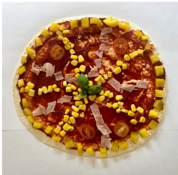
3 A mosaic pizza with sweetcorn, pepper, ham and tomato by S Creek

Are some patterns easier to make than others?