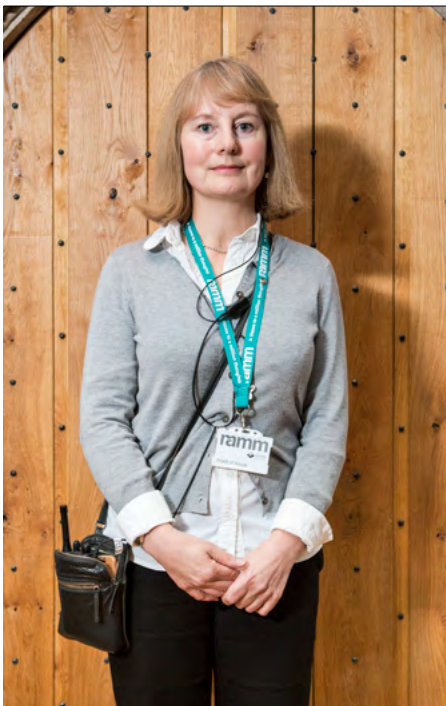
A member of staff