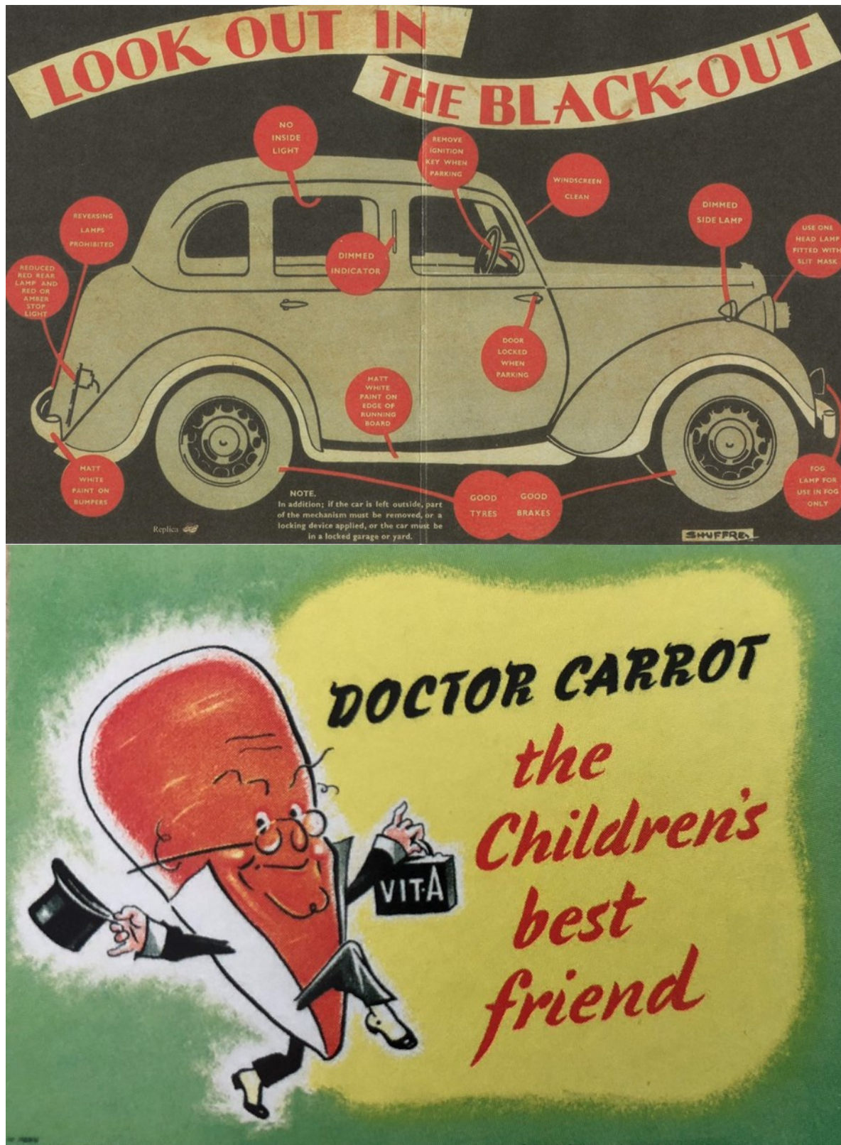
Second World War posters.