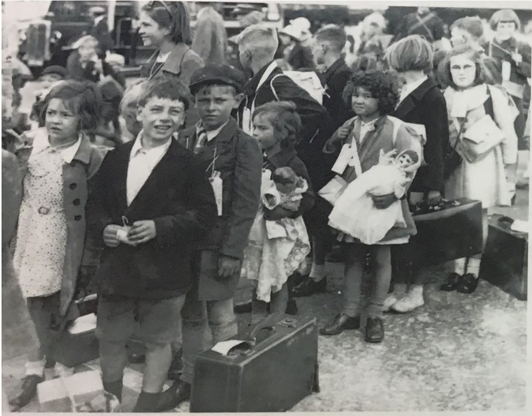
Evacuees arriving at Exeter St. David's Station by train

The government scheme to evacuate children from places that were likely to be bombed was called Operation Pied Piper. Families were sent a list of suggestions for what children should take with them.