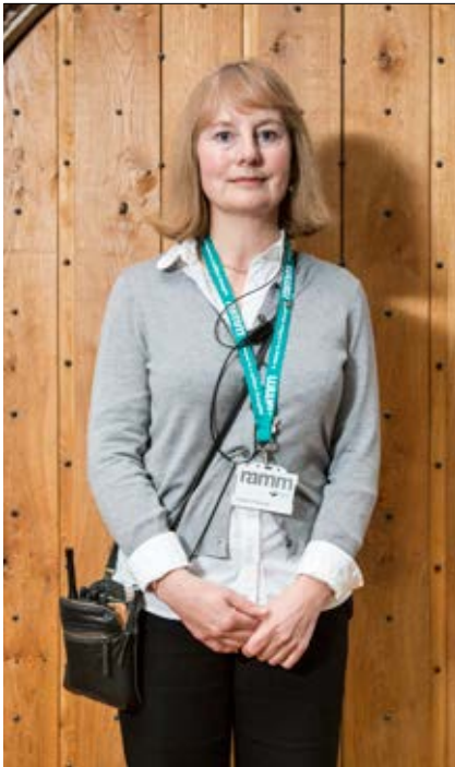
A member of staff