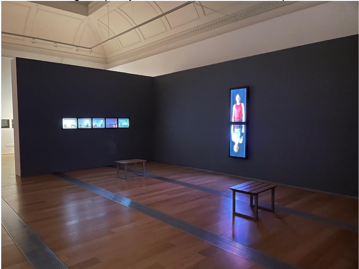
Figure 3: Exhibition space with seating

There is seating and plenty of room to move around the space.