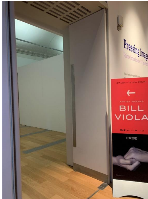
Figure 2: Second doorway into the exhibition.

This is the second door to the exhibition. This doorway is immediately to the left after you enter the first door. There is a large sign that points in the direction of the gallery.