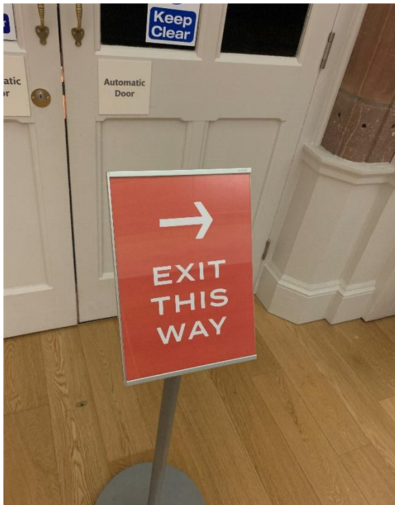
Figure 8: Sign pointing to exit

To exit the exhibition, follow the red sign to this doorway. Walk to the end of the gallery and exit through the automatic door to the Garden Reception.