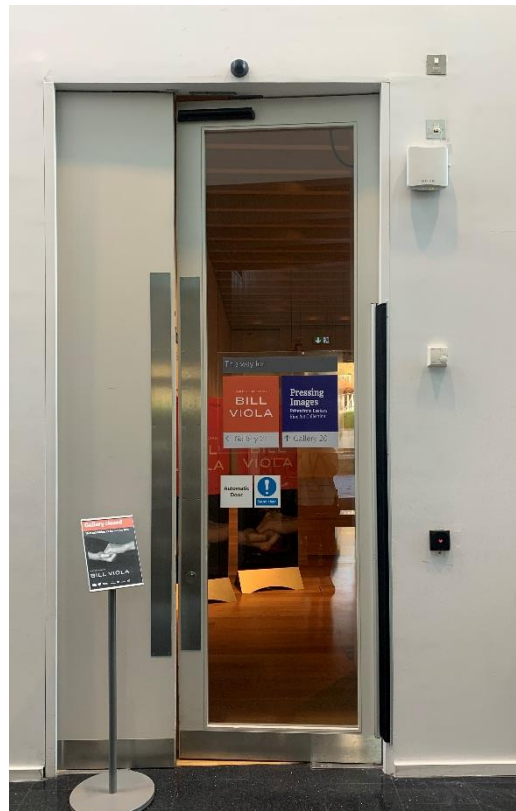
Figure 1: Image of the entrance to Gallery 20

The exhibition is in Gallery 21. To enter the exhibition, you go through 2 doors. This is the first door to Gallery 20 at Garden Reception. It will automatically open.