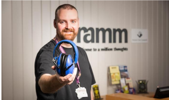
Figure 6: Ear Defenders available to borrow at RAMM

Anyone can borrow ear defenders at RAMM. You can ask at the reception desk. Please give them back when you leave. They are cleaned regularly between visitors.