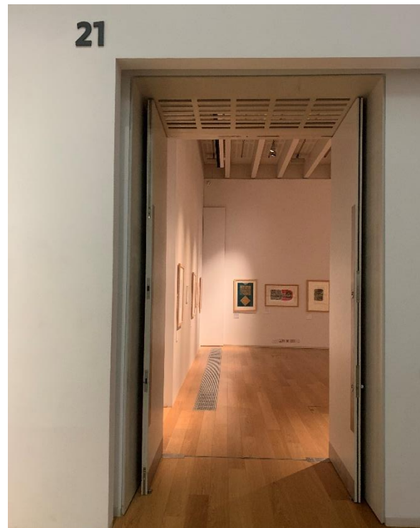
Figure 7: Exit doorway