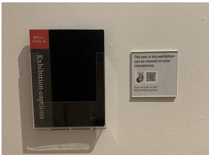
Figure 4: Exhibition caption booklet and QR code.

At the entrance, there is a booklet of large print captions and a QR code to access the captions on your smart phone.