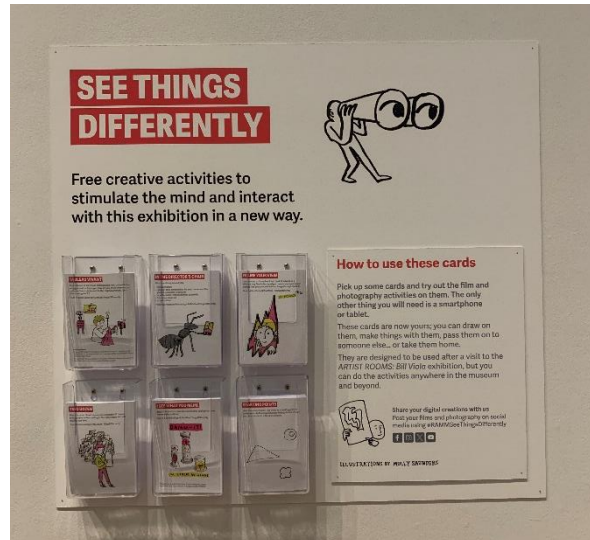
Figure 5: 'See things differently' activity cards

Near the exit, there are activity cards called 'see things differently'. These cards can be taken home or filled out in the museum.