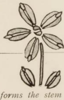
Each little daisy consists of five lazy-daisy loops in white wool, with a pink silk tip, and a French knot in the centre. A long straight-stitch forms the stem and two lazy-daisy loops the leaves.

In Delicate Shell Pink, Here is the Loveliest Hot-Water Bottle Cover