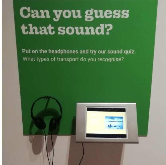
Figure 5: A picture showing the can you guess that sound interactive which includes a set of headphones and screen.

As you enter the second gallery you will also find an iPad with a pair of headphones. You can use these to listen to transport sounds.