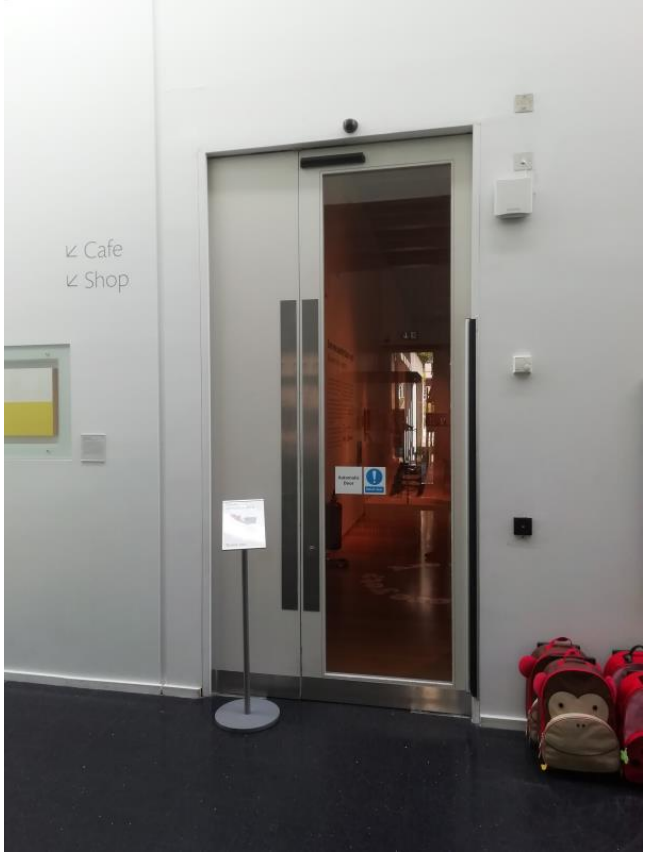
Figure 1: A glass door leading to gallery 20.

There are two entrances into the exhibition. If you arrive at the museum through the Garden Reception entrance you can enter through Gallery 20.