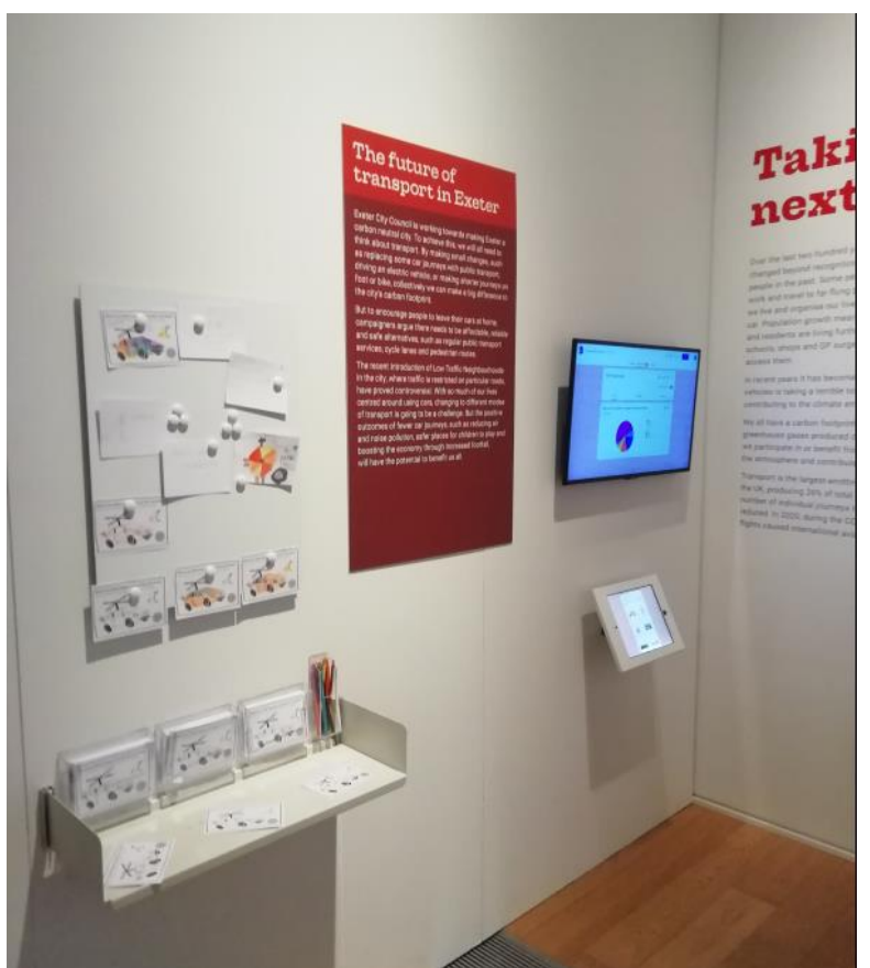
Figure 7: An interactive areas where you can share your ideas on the comment cards.

You can also view the ideas produced during a community project about future transport ideas. You can share your ideas using comment cards, available next to the screen. There will be a board for you to display your feedback card if you want to.