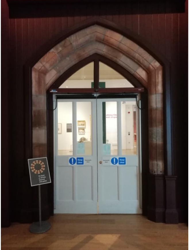
Figure 2: Double doors in Finders Keepers leading to the exhibition.

Alternatively, you can enter through the Finders Keepers gallery. You will pass a stuffed elephant and giraffe on your way to the door.