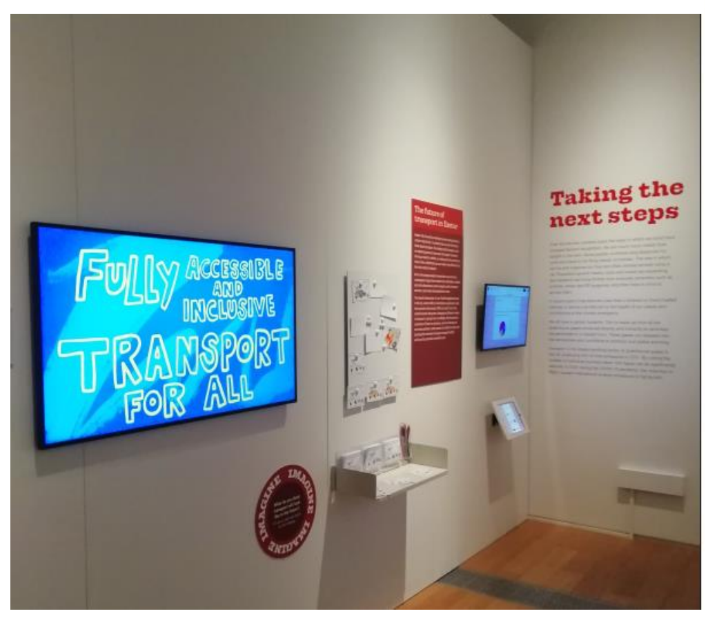
Figure 4: Image of two screens and an area to leave your feedback