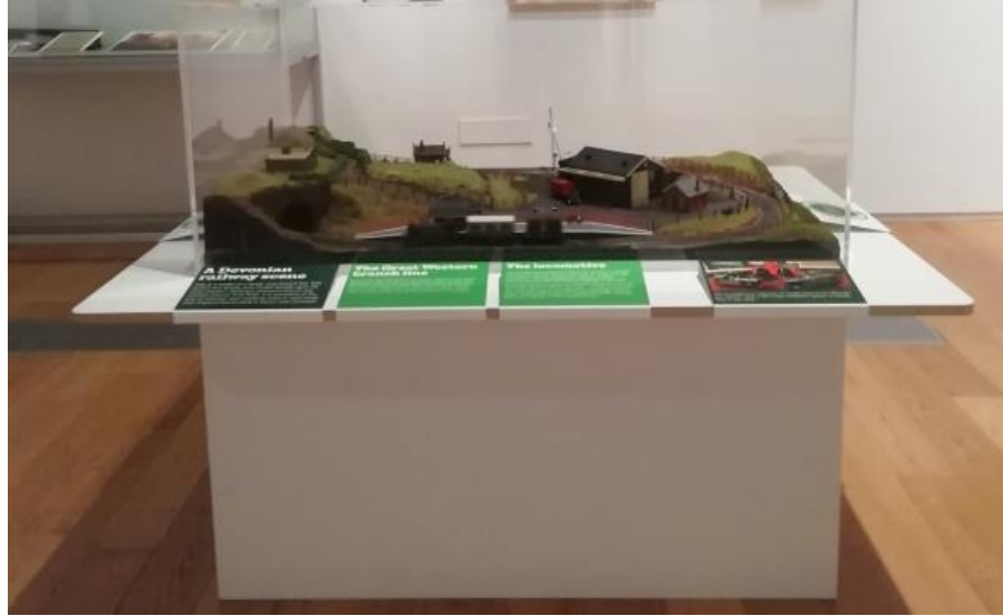
Figure 10: Model train set

In our second gallery, you can also see a moving model train displayed in the centre of the room.