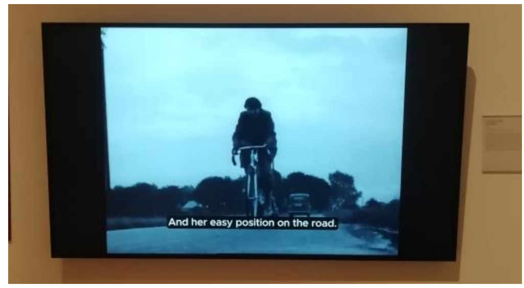
Figure 3: A screenshot of a person riding a bicycle on a TV screen

The first gallery your will enter will feature one short film, 1 minute and 27 seconds long, with low noise and subtitles. There are two films to watch in the second gallery. Both are silent. The first is 1 minute and 47 seconds long and the second is 2 minutes and 47 seconds.