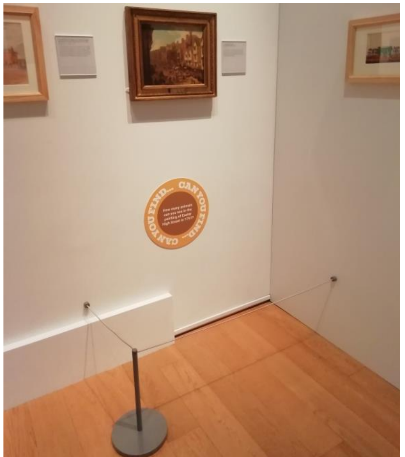
Figure 11: A picture of a set of paintings

Several of our objects will be on open display. This means they will not be behind glass but may be surrounded by a rope. Please do not touch these items as they are delicate.