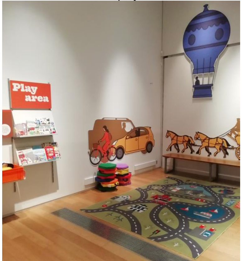
Figure 6: A picture of the children's area

The children's area of the exhibition can be found in the corner to the right as you enter from Gallery 20. Here you will find seating, a dressing up space, a carpet and a train track to be played with.