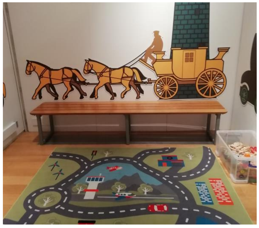
Figure 8: A picture of the children's area.

A bench and some cushions can be found in the children's area in the first gallery, to the right of the entrance. There is also a bench in the second gallery.